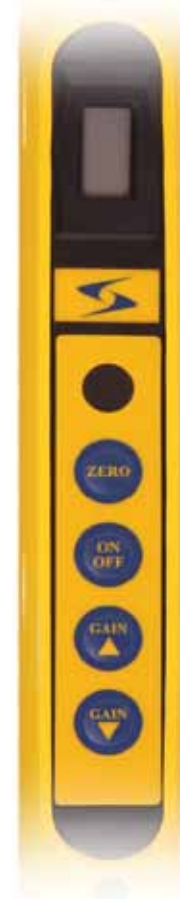
The keypad on the ML-3 includes controls for Power, Gain Up and Gain Down, and a Zero button that adjusts the unit for magnetic anomalies such as a magnetic gradient in the soil. The speaker is positioned between the keypad and the LCD display.

"You can hear it very clearly under water, so you could snorkel with it and there's no question that you can tell when you come across something that's metallic under water," Rauhen said, noting that a diver took the ML-3 down more than 200 feet in Lake Michigan, where tests of the instrument