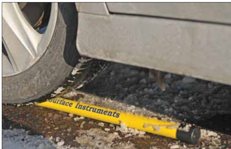
The new ML-3 magnetic locator from SubSurface Instruments was originally designed for the military, a client for whom durability is key. Sales manager Scott Rauhen drove over the instrument repeatedly during a demonstration in December to prove that it can take a beating and still function properly.

top. The display also provides a low-battery indicator. While the display does not show the gain setting, it is simple to turn the gain all the way down and start over from there if it's necessary to determine the exact setting.