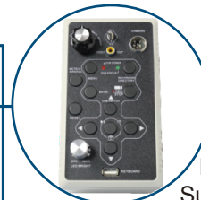
New style control box Easier to operate Support flash Disk