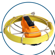
Fiberglass Rod 40m cable length ø5mm cable diameter Wheel: ø320x110(h) mm