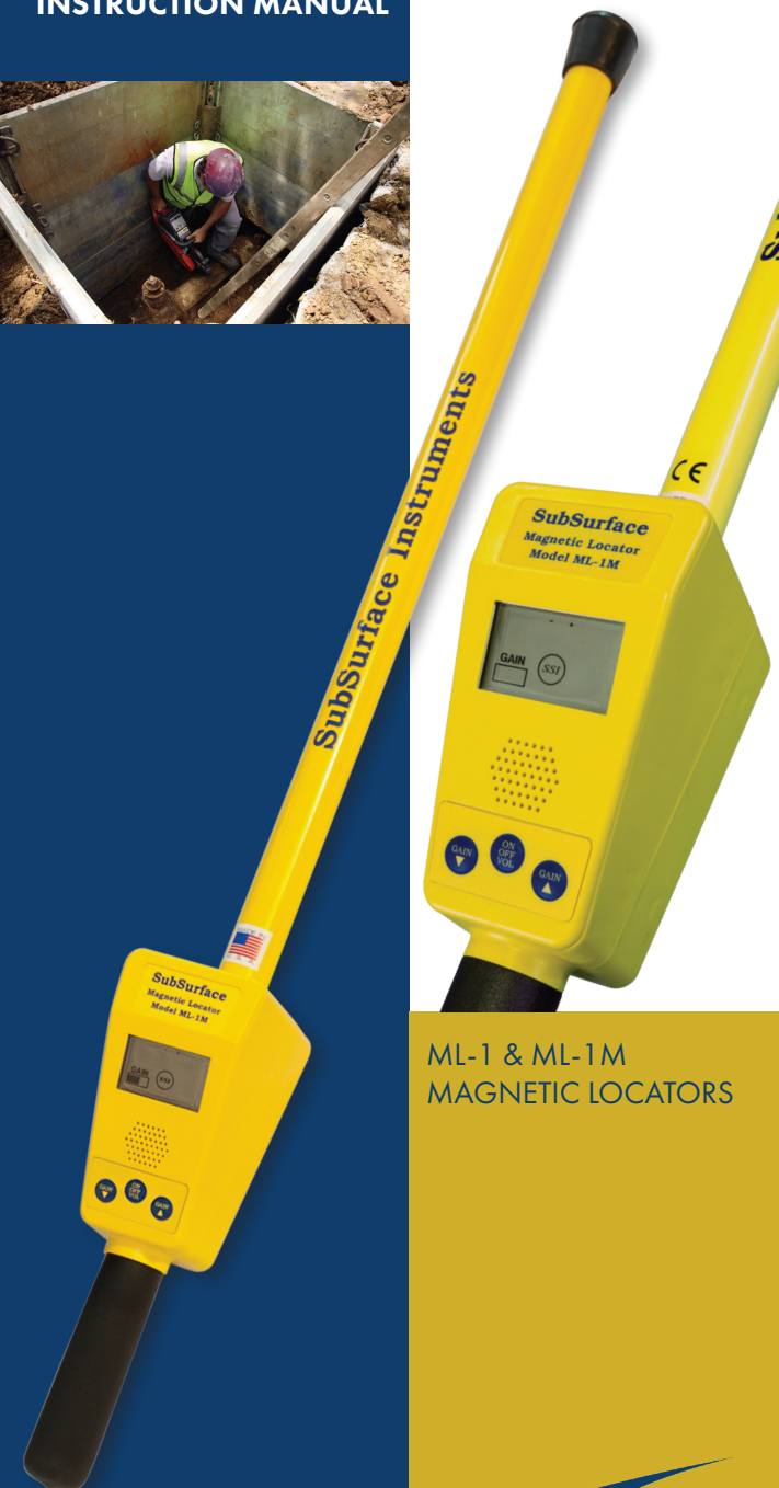
ML-1 & ML-1M MAGNETIC LOCATORS